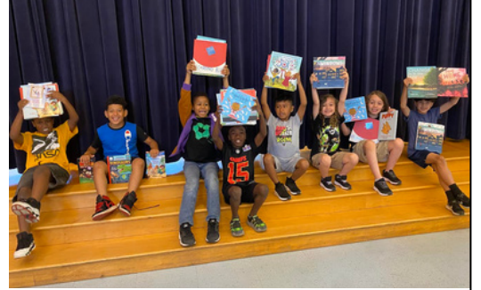
LEAPers show off their new Book Fair books.