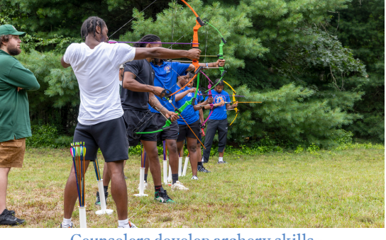
Counselors develop archery skills.