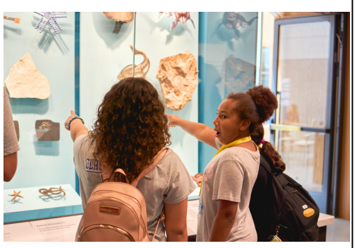
Students in awe of the echinoderm fossils at the Yale Peabody Museum.