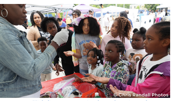
Kids line up to try fresh produce from the Farmers Market.